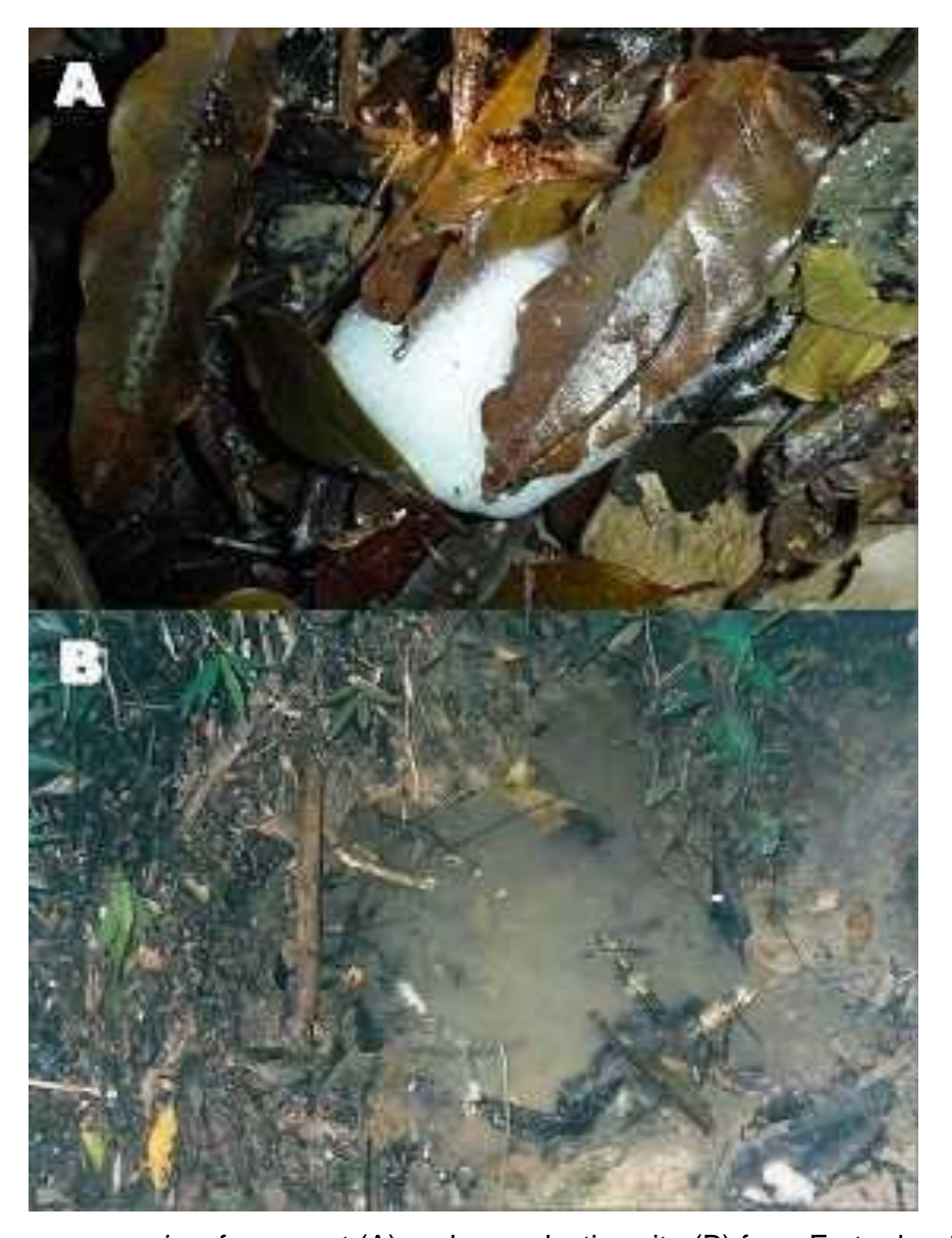
Figure 2. Physalaemus moreirae foam nest (A) and reproductive site (B) from Forte dos Andradas, Guarujá, SP

During fieldwork, the vocalization of P. moreirae can be easily confused with that of P. angrensis and even P. atlanticus . Fortunately, the acoustic variables of their advertisement calls can be used to help correct species identification.