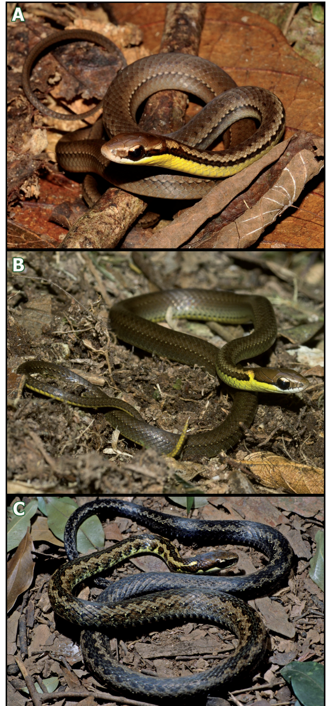
Figure 1. Species analyzed in the present study: (A) Echinanthera cephalostriata, (B) E. cyanopleura, and (C) E. undulata.

esis, which predicts a higher breakage frequency in males, which presumably present higher mobility during the mating season and are, therefore, more susceptible to predation (Vitt et al., 1974; Bonnet et al., 1999); (2) the size hypothesis, which predicts a higher breakage frequency in larger—and theoretically older—specimens compared to smaller ones, since the former would have probably been exposed to more predation attempts during a proportion-