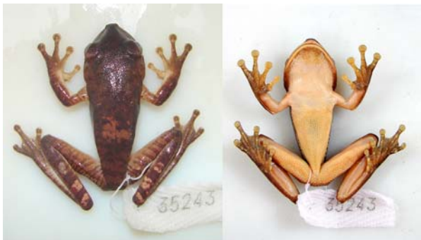
Figure 3. Paratype of Hypsiboas pombali , adult male collected at Parque Estadual Serra do Canduru , municipality of Itacaré, Bahia, Brazil. (MNRJ 35243).

Caramaschi et al. (2004) pointed out that the specimen referred by Bokermann (1966a) as H. secedens is in fact Hypsiboas pombali (Caramaschi et al. 2004) (Figure 3). Thus, considering that the specimen from Linhares, Espírito Santo is actually Hypsiboas pombali , the record of H. secedens from the state of Espírito Santo should be eliminated, decreasing the distribution range of the species to Barro Branco, municipality of Duque de Caxias, state of Rio de Janeiro.