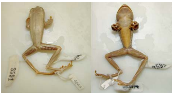
Figure 1. Hypsiboas secedens , holotype, adult male (MNRJ 3591).

Hypsiboas secedens (Lutz, 1963) belongs to the Hypsiboas pulchellus species group, which is presently composed of 30 species. This group was proposed by Faivovich et al. (2005) based on phylogenetic analysis using DNA and morphological data. In the original publication (Lutz 1963), the type locality of Hypsiboas secedens was given as Barro Branco, in the state of Rio de Janeiro (ca. 22°23' S, 43°15' W) yet, the holotype (Figure 1) and 29 paratypes were bought from a commercial collector (A. Passarelli) whose indications of collecting localities were generally accurate. The species was recorded at Reserva Ecológica de Sooretama (former Parque de Sooretama ), municipality of Linhares, Espírito Santo by Bokermann (1966a) (Figure 2).