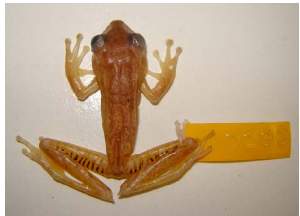
Figure 5. Hypsiboas secedens , young individual collected at Reserva Ecológica de Guapiaçu , municipality of Cachoeiras de Macacu, Rio de Janeiro, Brazil. (ZUF RJ 10319; SVL 37,8 mm).

Two additional specimens of Hypsiboas secedens were found in the amphibian collection of the Museu Nacional do Rio de Janeiro . Specimen MNRJ 40609 was collected by R.V. Marra at REGUA in October 2004; and MNRJ 40615 by F.H. Hatano in November 2004 at Estação Ecológica Paraíso , municipality of Guapimirim (Figure 6).