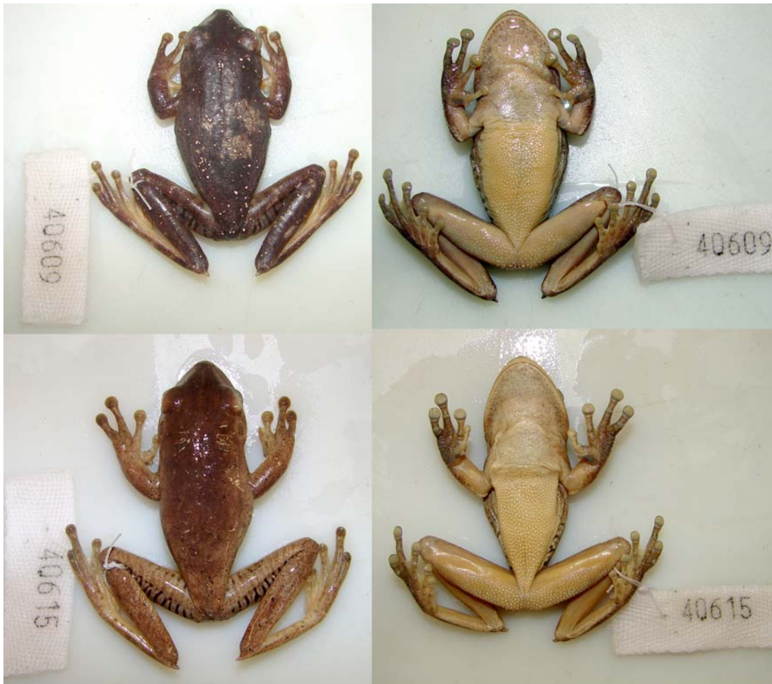
Figure 6. Adult males of Hypsiboas secedens deposited at the MNRJ Amphibian Collection. (MNRJ 40609; SVL 53,6 mm and MNRJ 40615; 55,1 mm)